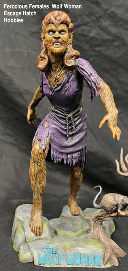
Ferocious Females Wolf Woman Escape Hatch Hobbies