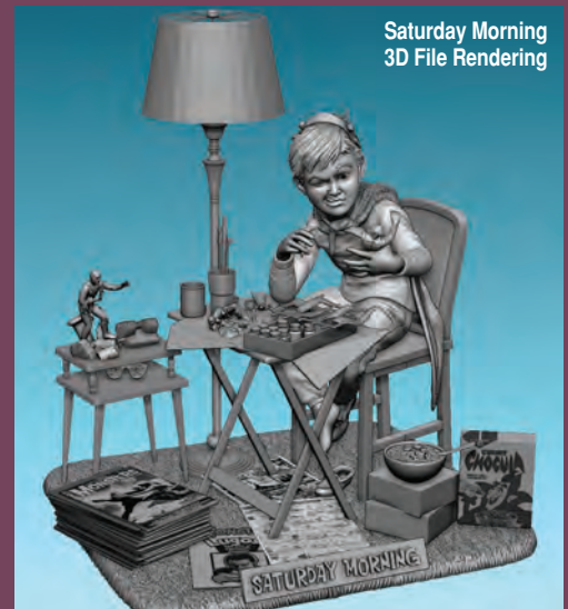
Saturday Morning 3D File Rendering

Todd Powell owns Escape Hatch Hobbies, www.escapehatchhobbies.com .