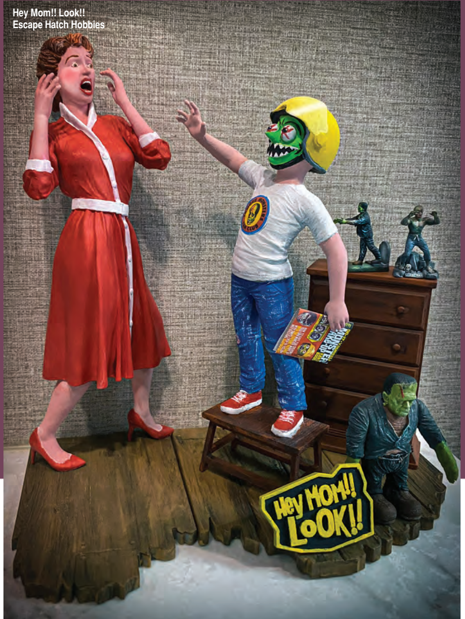
Hey Mom!! Look!! Escape Hatch Hobbies