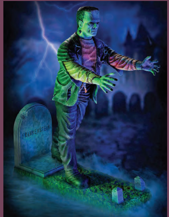
Samples of Michael's Aurora photo illustrations: Top: The Forgotten Prisoner Bottom: Frankenstein Opposite: The Creature