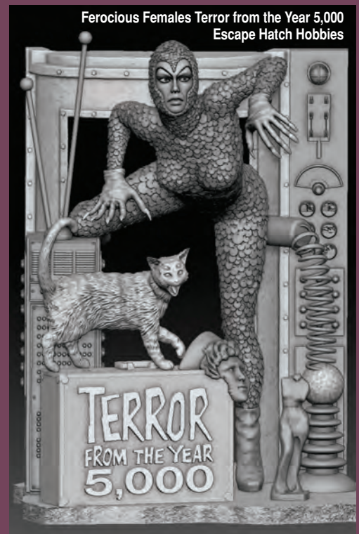
Ferocious Females Terror from the Year 5,000 Escape Hatch Hobbies