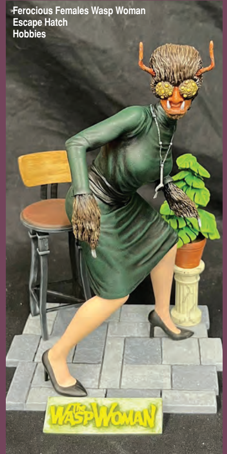
Ferocious Females Wasp Woman Escape Hatch Hobbies