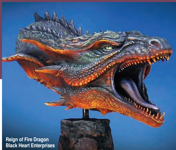
Reign of Fire Dragon Black Heart Enterprises