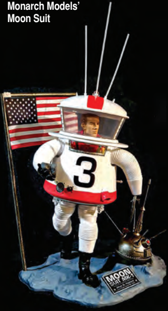
Monarch Models' Moon Suit