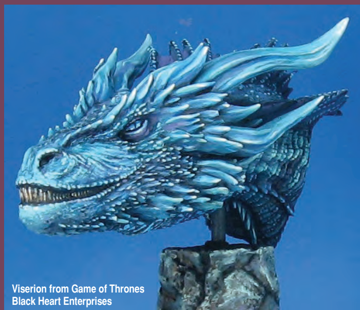
Viserion from Game of Thrones Black Heart Enterprises

I was all over that, happy to see the collaboration expand to encompass all of the kits Michael already had on the market and the ever-growing lineup he's created since, including more GigantAuroras and mini-busts, a line of monsters called the Ferocious Females, Creature from the Haunted Sea, a near-to-his heart piece called Hey Mom!! Look!! and more, including a variety of replacements, add-ons and offshoots for the Fly and Moon Suit, the first