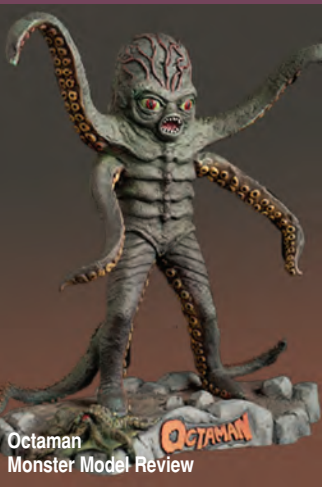
Octaman Monster Model Review