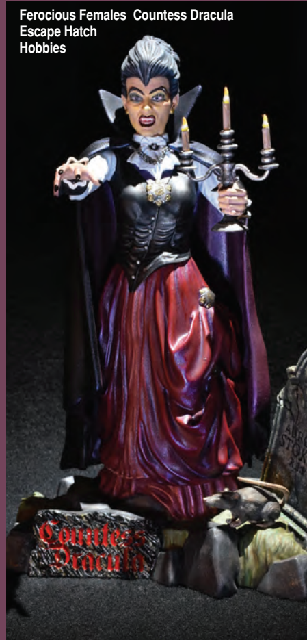
Ferocious Females Countess Dracula Escape Hatch Hobbies