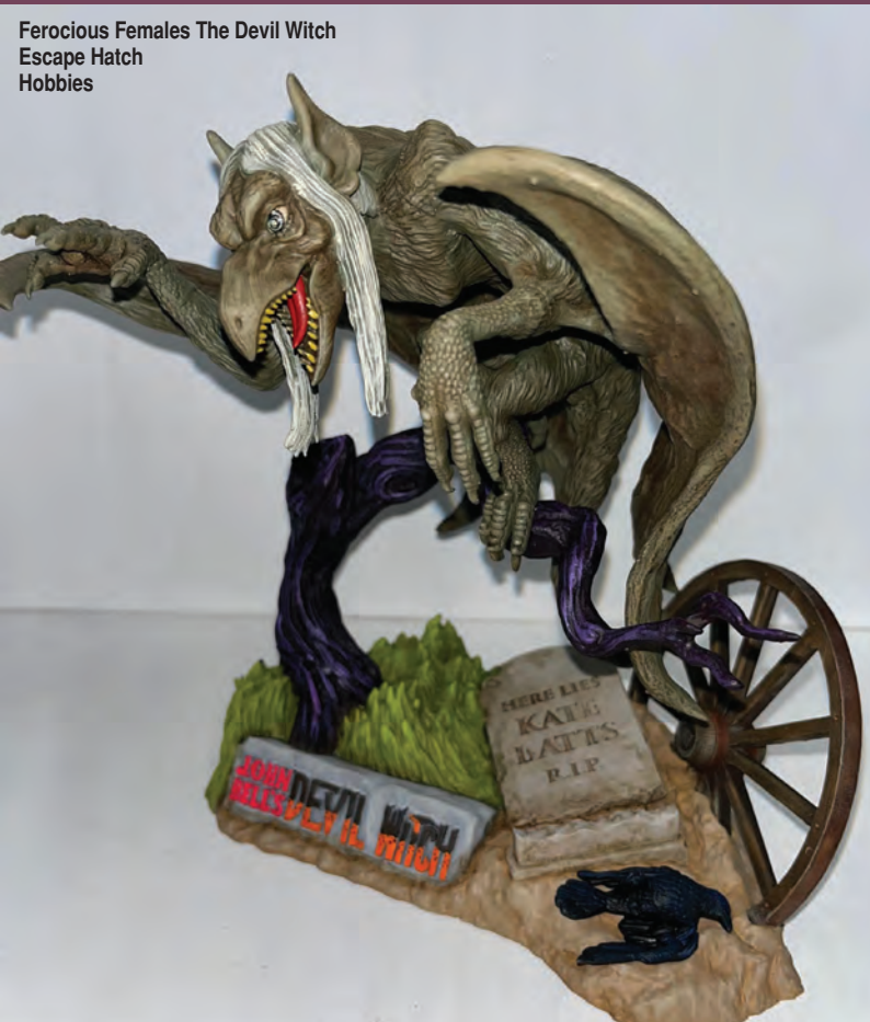
Ferocious Females The Devil Witch Escape Hatch Hobbies