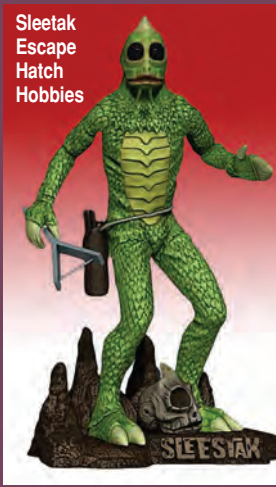
Sleetak Escape Hatch Hobbies