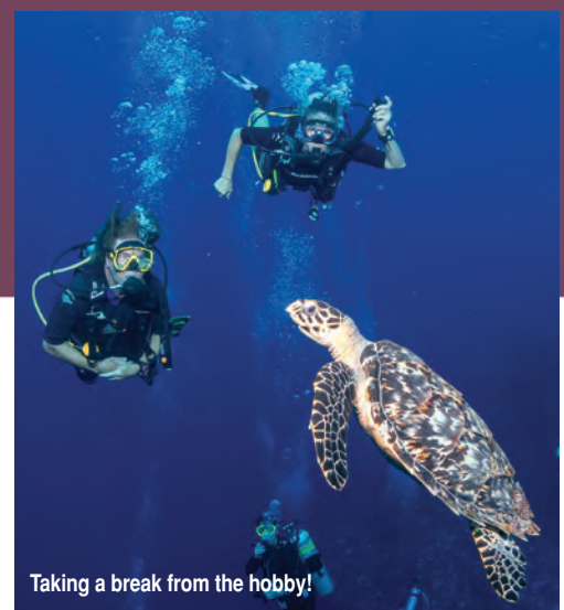
Taking a break from the hobby!