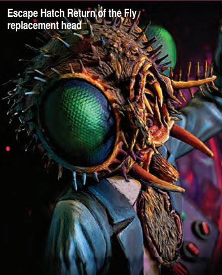
Escape Hatch Return of the Fly replacement head