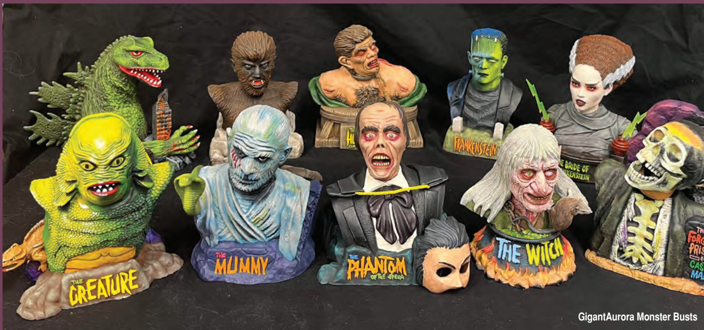
GigantAurora Monster Busts

to switch gears/clients so he could continue to do so. We always loved camping, and this would be more like glamping, therefore easier and more comfortable, and we were very tired of Minnesota messy slushy cold long winters. We are also very adaptive to new surroundings, and adventurous. It also made sense given that we are approaching a 'retirement age' traditionally and affords us a more creative option to enjoy our sixties actively."